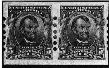
US no. 315 Schermack Private Vending Machine Coil type II, o.g., Scott $3,500, realized $10,350