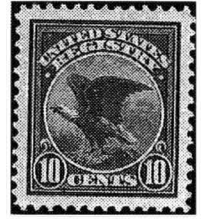
US no F1, n.h., Scott $110 realized $552