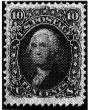
US no. 96, o.g., l.h., Scott $1,750 realized $4,025