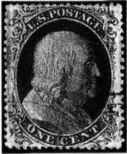
US no. 22, used, Scott $375 realized $1,265

SELECTED HIGHLIGHTS FROM SPINK AMERICA'S APRIL 9, 1998 NEW YORK PUBLIC AUCTION WHICH REALIZED IN EXCESS OF ONE MILLION DOLLARS