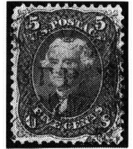
US no. 67, used, Scott $660 realized $1,725