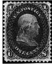
US no. 63b, o.g., l.h., Scott $450 realized $1,840