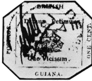
The One Cent Magenta

The epitome of classic stamps. Owned by one of our clients.