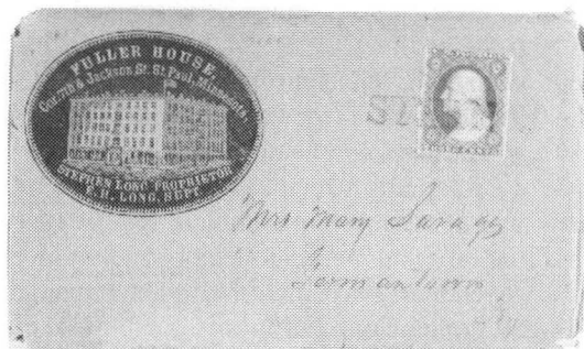
Minnesota Territory. 1857 usage with steam cancel and cameo for Fuller House