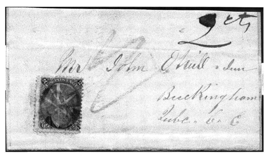
Figure 13. Wrapper with 2¢ Black Jack

Figure 13 is a wrapper sent in by Route Agent Paul Abajian. It is franked with a 2¢ Black Jack and has only two markings: a black manuscript "2 cts" at upper right corner, and what appears to be a large "2" scrawled across the middle. Paul feels it is not a complicated solution, but he would like to know where the wrapper is addressed, the total postage rate, and the meaning of the two "2"s.