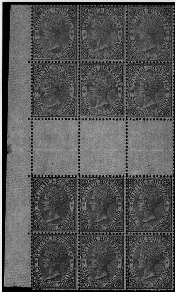
British Honduras, 1865, the famous and unique 1d. and 1/- se-tenant block. Sold on 10 March 2005 for £120,750.

CONTINUING TO ACHIEVE RECORD PRICES AT AUCTION