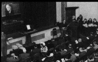
Harmers Roosevelt public auction, 1946.